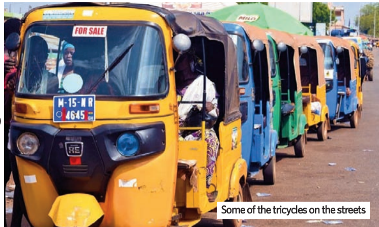
Some of the tricycles on the streets