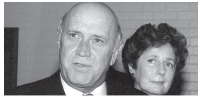
Marieke de Klerk (R) was South Africa's first lady between 1989 and 1994