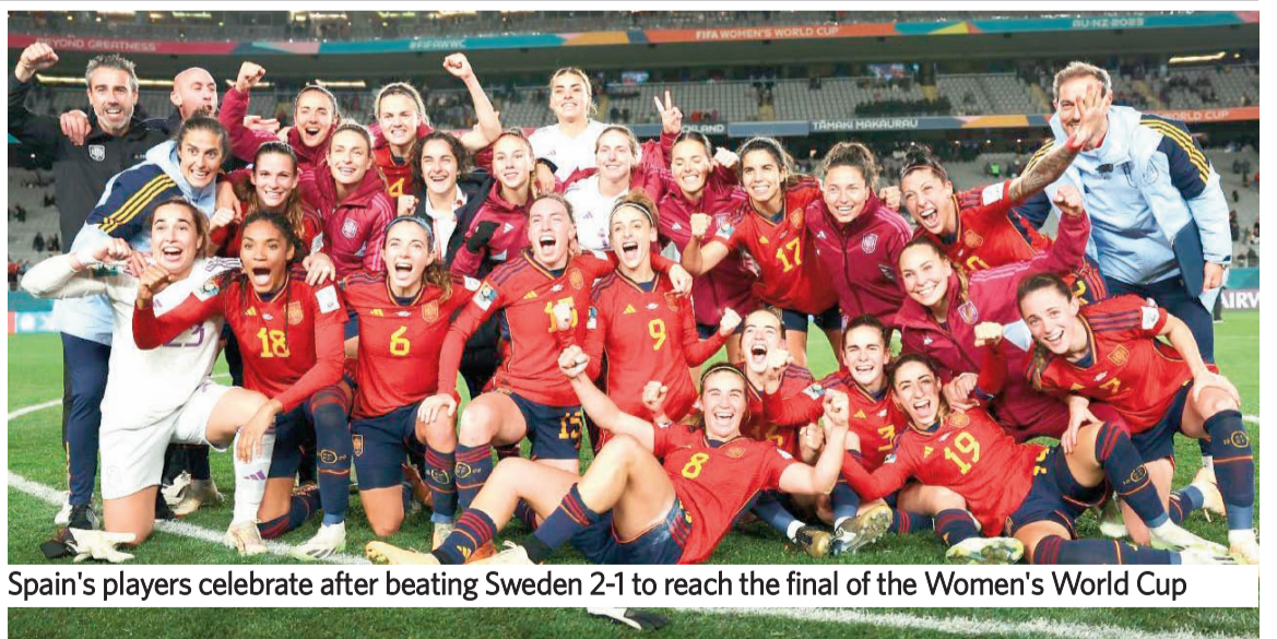
Spain's players celebrate after beating Sweden 2-1 to reach the final of the Women's World Cup