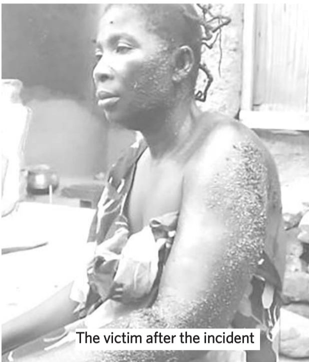
The victim after the incident