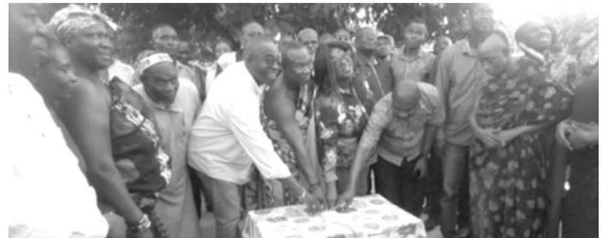
The MPs, Nananom and NEDCo officials jointly pressing button to connect communities to the national grid

According to the Minister of Sanitation, the government would supply