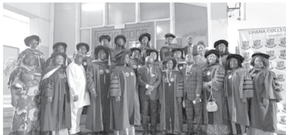
Some of the inductees with the faculty

the GCNM induction ceremony of 1,542 nurses and midwives who have completed their training in a number of specialised areas.