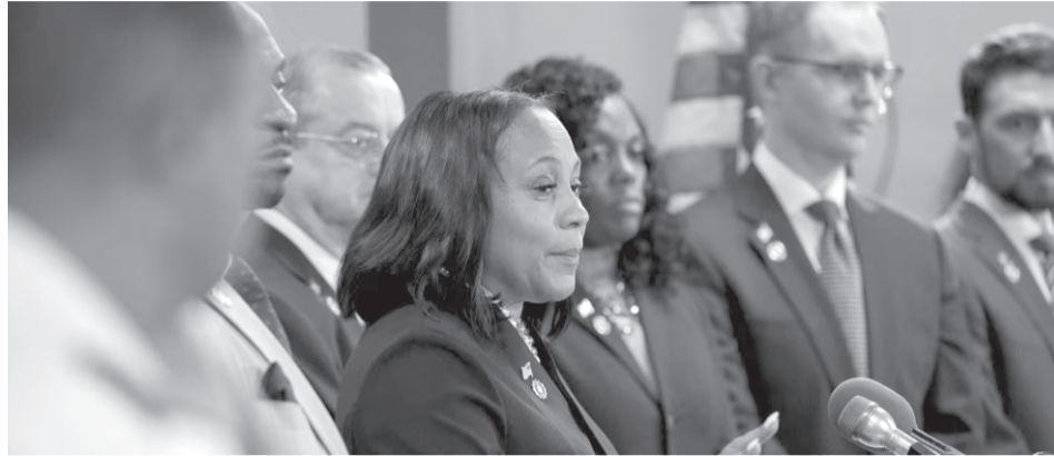
Fulton County District Attorney Fani Willis (C) speaks in the Fulton County Government Center during a news conference in Atlanta

A GRAND jury in the U.S. state of Georgia has indicted former President Donald Trump and 18 others in connection with efforts to overturn his 2020 election loss.