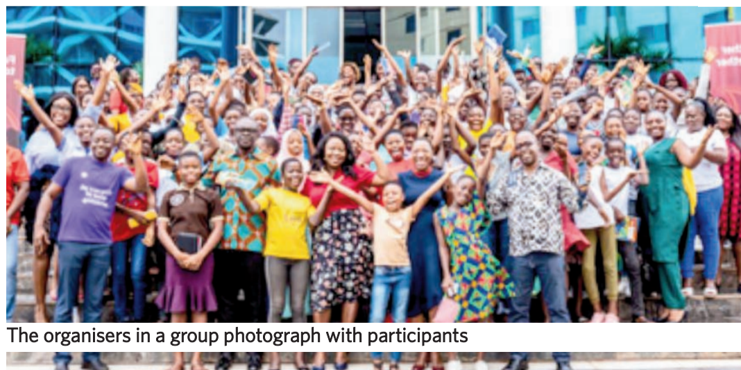
The organisers in a group photograph with participants