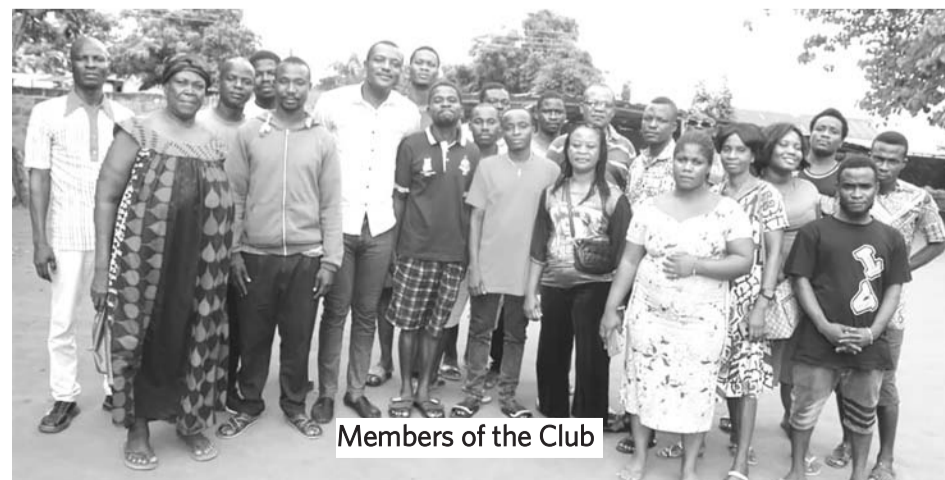
Members of the Club

Delegates in the region expressed their excitement and the need to give the hardworking and innovative Vice President a resounding victory. However, they also appealed to Dr. Bawumia to assist them with a pool tractor and farm inputs to boost their farm produce.