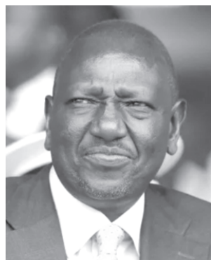
President William Ruto

An unnamed witness quoted by Russian newspaper Izvestia said the fire had started at a car park opposite the petrol station. BBC